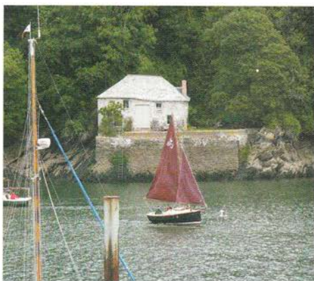
The Duchy leads the sail past