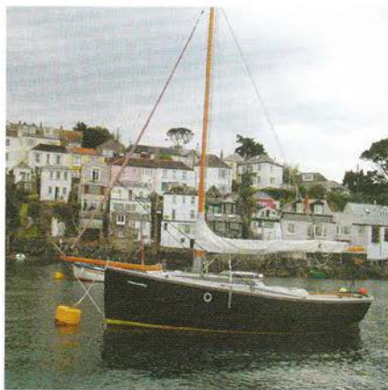
Shrimper moored in Polruan