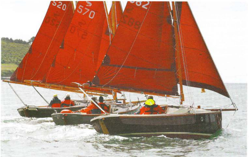
Racing during National Shrimper Week